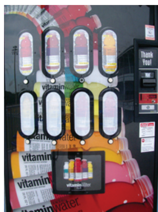
Coca Cola products vending machines help support our programs.